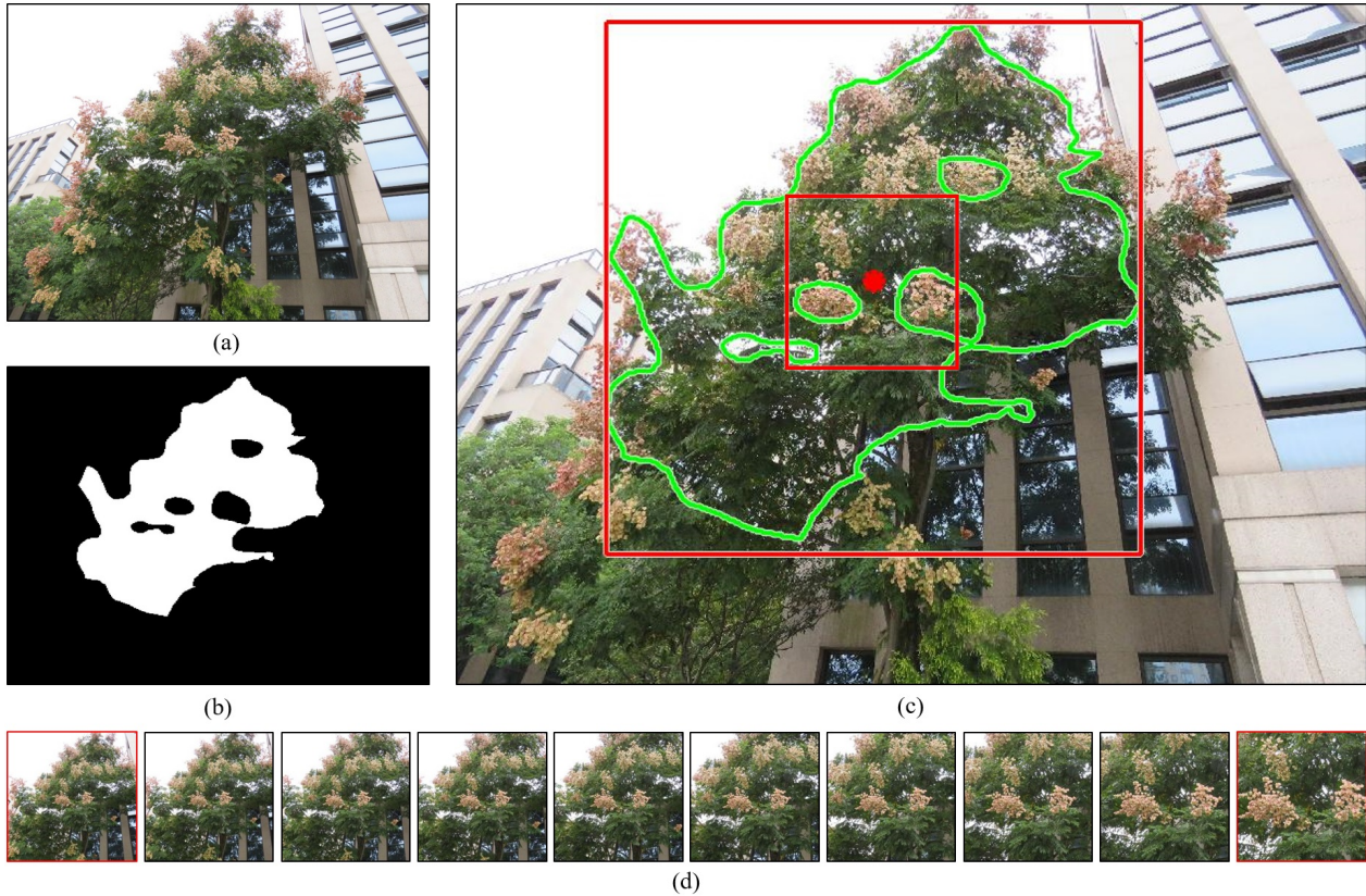
Figure 2. (a) Input image ( Koelreuteria formosana ), (b) Mask produced by the MIT Scene Parsing [30], (c) Bounding box of the RoI (red square enclosing green), centroid (red dot), and close-up (red square around the centroid), and (d) Multi-scale extracted patches.